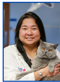
Dr. Aki Otomo Care Center