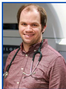
Dr. Chris Bloom Care Center