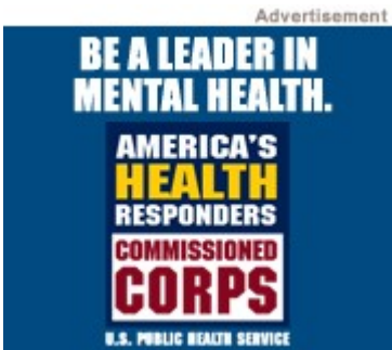
180 x 150: side column