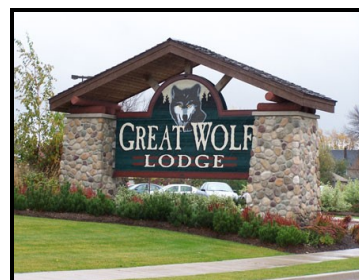
Presented by the Cincinnati Veterinary Medical Association

The 2015 Fall Short Course is rapidly approaching! We're set to go on Sunday, October 18, 2015 , at the Great Wolf Lodge. The CVMA Program Committee has worked very hard to provide a top notch program with national speakers.